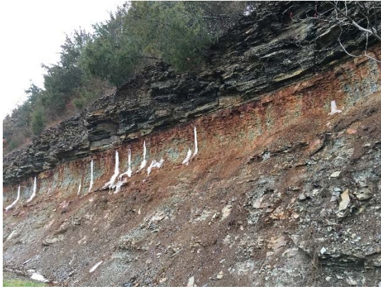
New Albany Shale Formation

MP 13.9-14 – This existing cut contains the acid producing New Albany Shale Formation material (dark material at top of cut in picture). Cuts in this formation are typically over-excavated on a 2H:1V slope and capped with impervious control surface water from reacting with the pyrite in the shale.