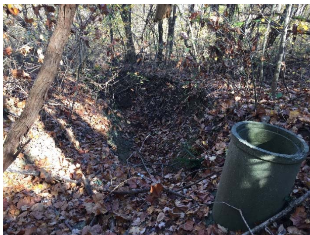
Failing concrete pipe